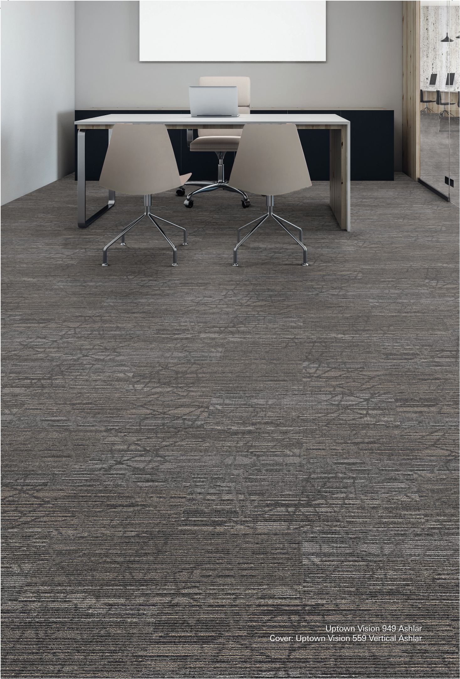
Uptown Vision 949 Ashlar Cover: Uptown Vision 559 Vertical Ashlar