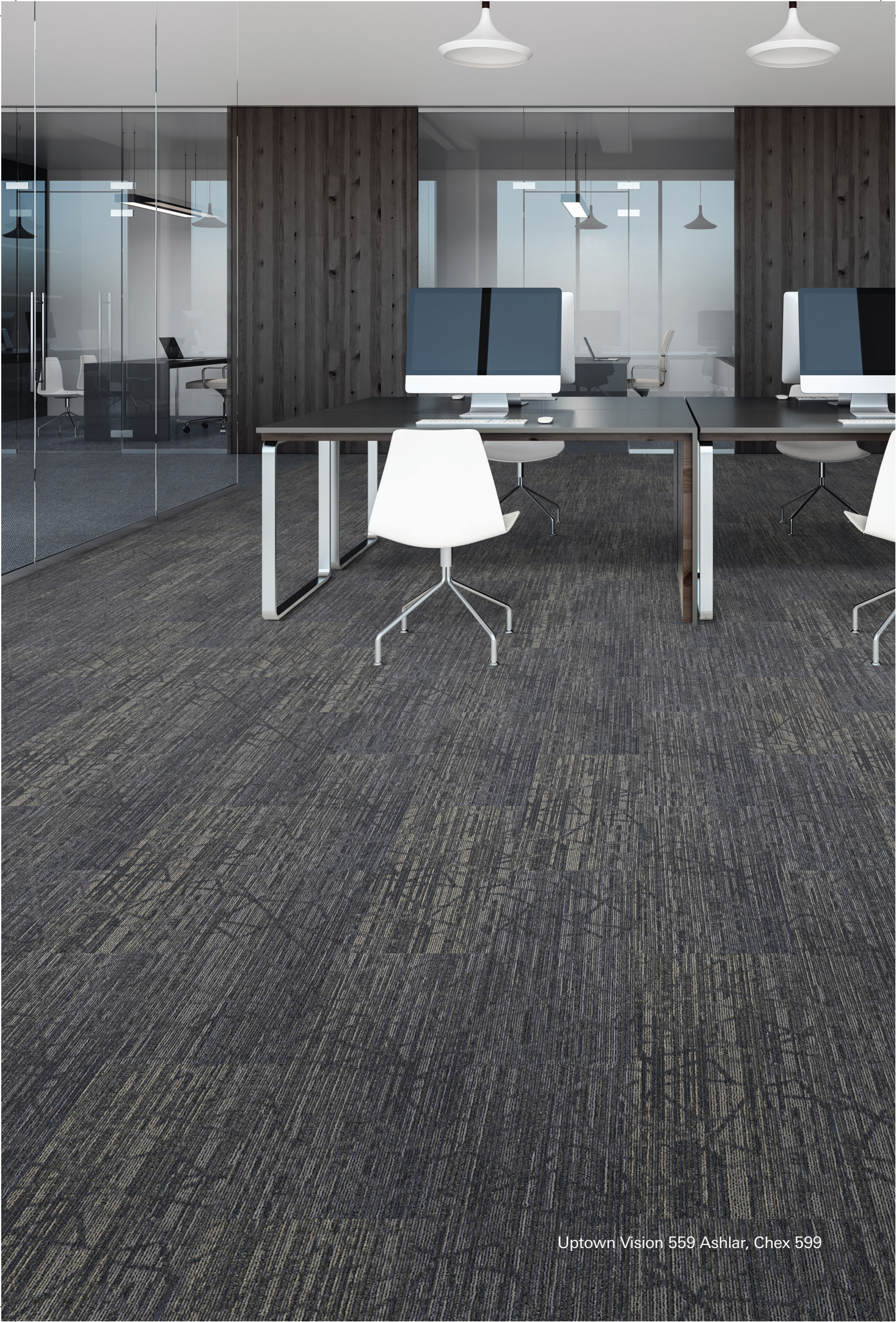
Uptown Vision 559 Ashlar, Chex 599