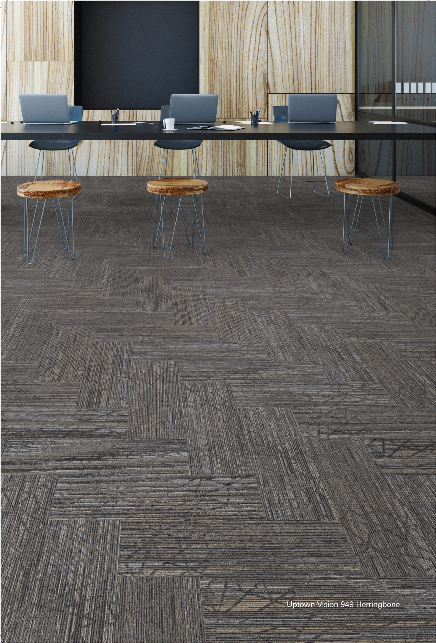
Uptown Vision 949 Herringbone