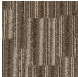
728 River Rock