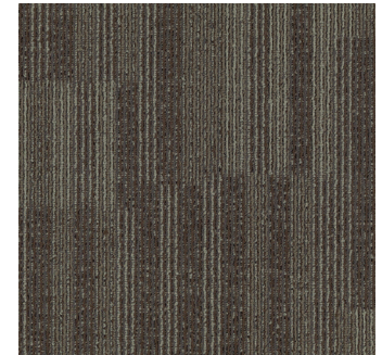
858 Timber Bark