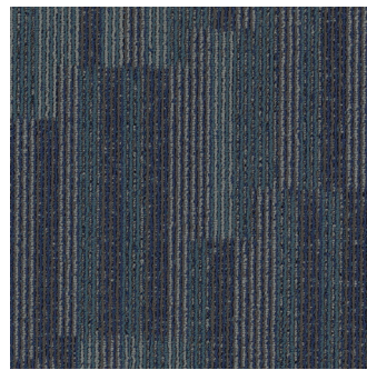
559 Blue Stream