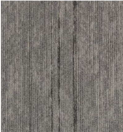
Narrow Accent Stripe