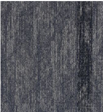
Large Accent Stripe