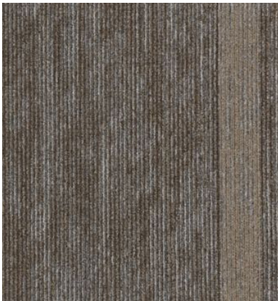
Large Accent Stripe