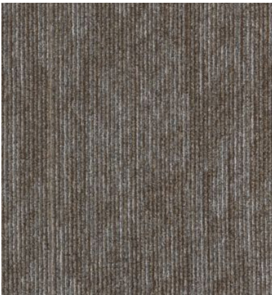
No Accent Stripe