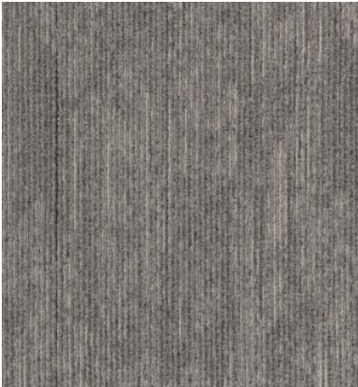
No Accent Stripe