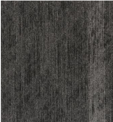
Large Accent Stripe