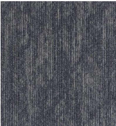
No Accent Stripe