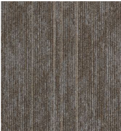
Narrow Accent Stripe