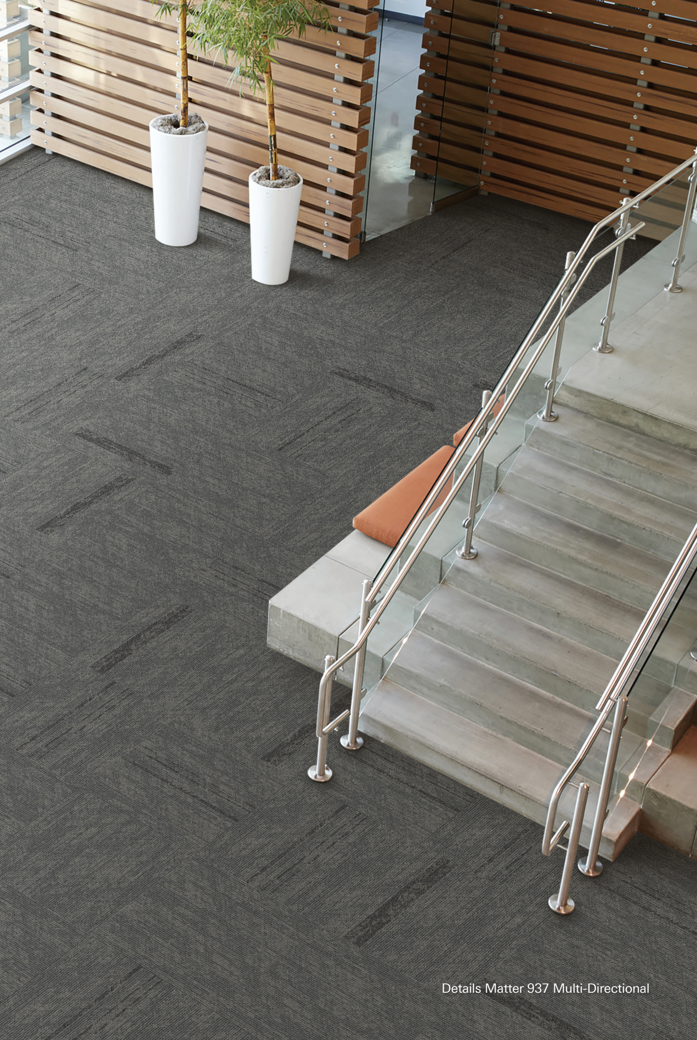
Details Matter 937 Multi-Directional