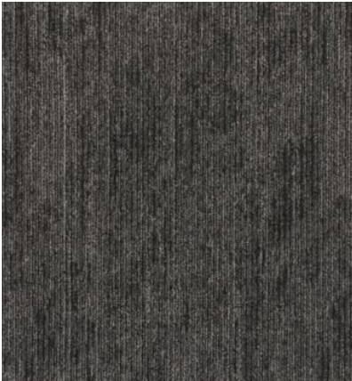
No Accent Stripe