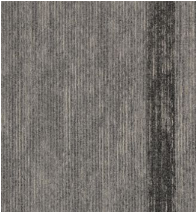
Large Accent Stripe