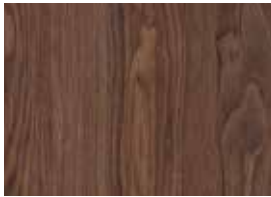
106 Chocolate Oak (12 mil) 88 Chocolate Oak (6 mil)