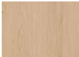
108 Blonde Maple (12 mil) 91 Blonde Maple (6 mil)