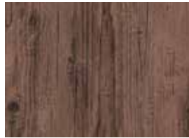
111 Toasted Barnwood (12 mil) 101 Toasted Barnwood (6 mil)