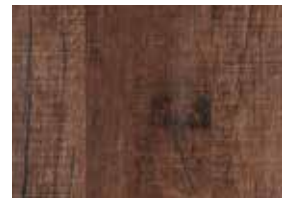
113 Chocolate Barnwood (12 mil) 103 Chocolate Barnwood (6 mil)