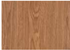
104 Natural Oak (12 mil) 86 Natural Oak (6 mil)