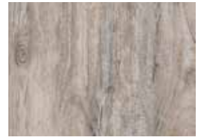
112 Weathered Barnwood (12 mil) 102 Weathered Barnwood (6 mil)