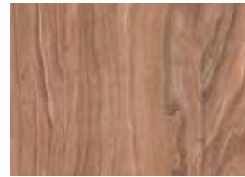
109 Toasted Chestnut (12 mil) 92 Toasted Chestnut (6 mil)